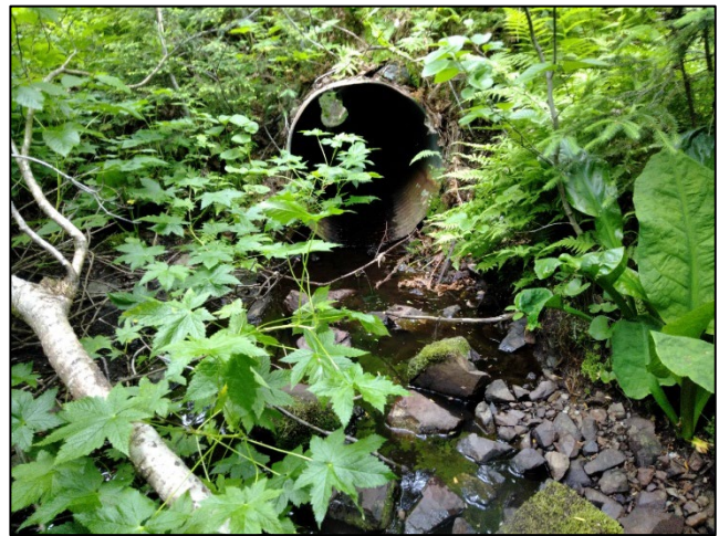
Figure 3.—Outlet of culvert at waypoint 478.