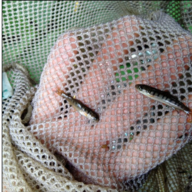
Figure 1.—Juvenile coho salmon captured at waypoint 477.