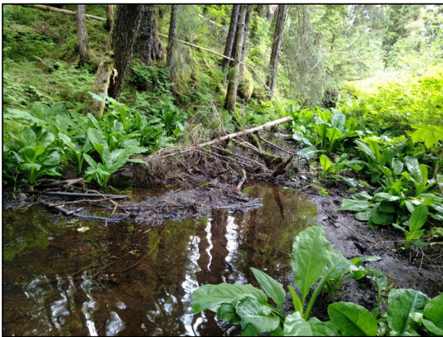
Figure 2.—Channel at waypoint 477.